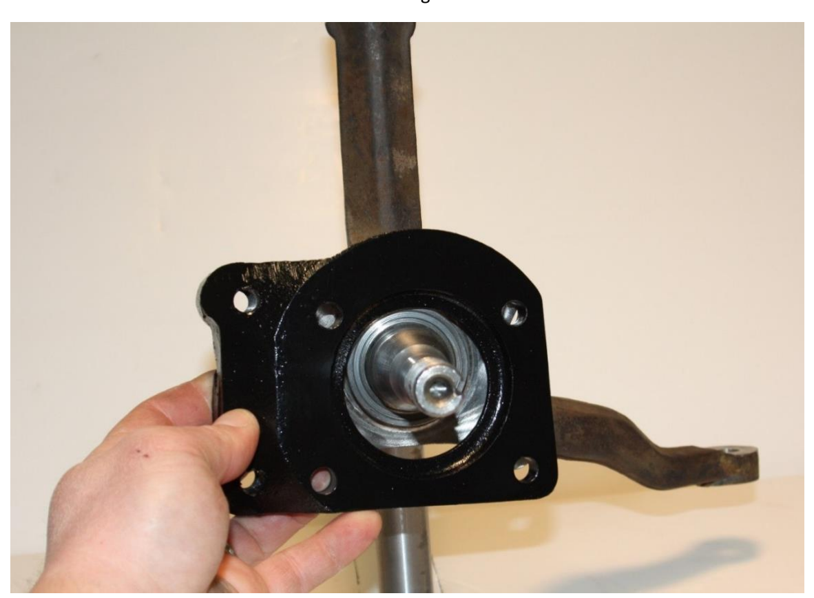
← Front of Car Photo

Applications : 67-73 Mustang, 67-69 Falcon, 67-69 Fairlane, Ranchero, Comet, Cyclone, 67-73 Cougar, 68-71 Torino, Montego