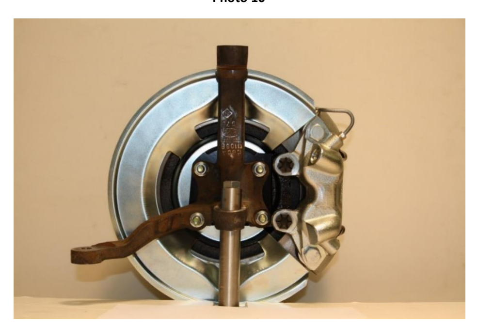
Front of car→